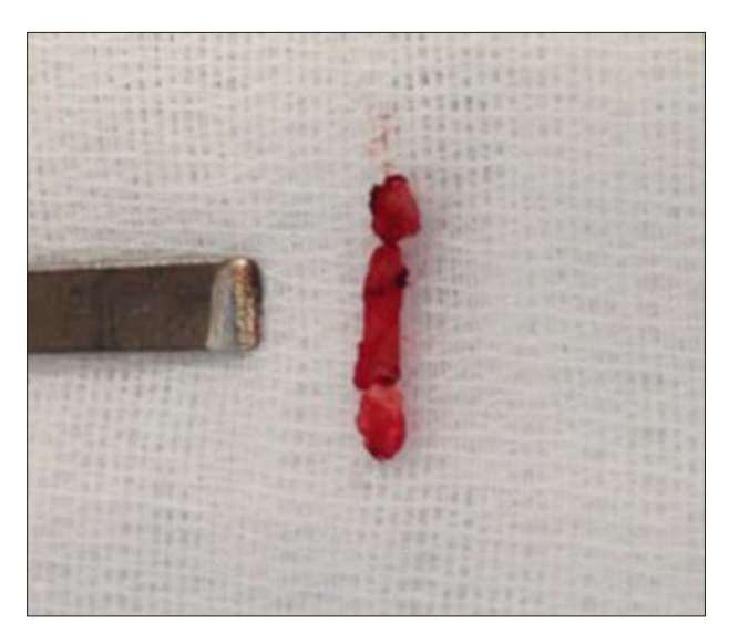
Figure 3. Resected specimen of the calcified stylohyoid ligament

Bartłomiej Kulesza, Paweł Szmygin, Witold Janusz. Eagle Syndrome and cervical disc herniation – combined symptomatology and treatment. Case report